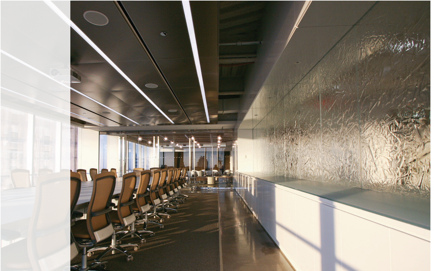
MANSUETTO VENTURES- NEW YORK, NY - Kiln-Fired Tempered Glass for Interior Privacy Panels - Shown in MD212 Myst 1/4" Starphire