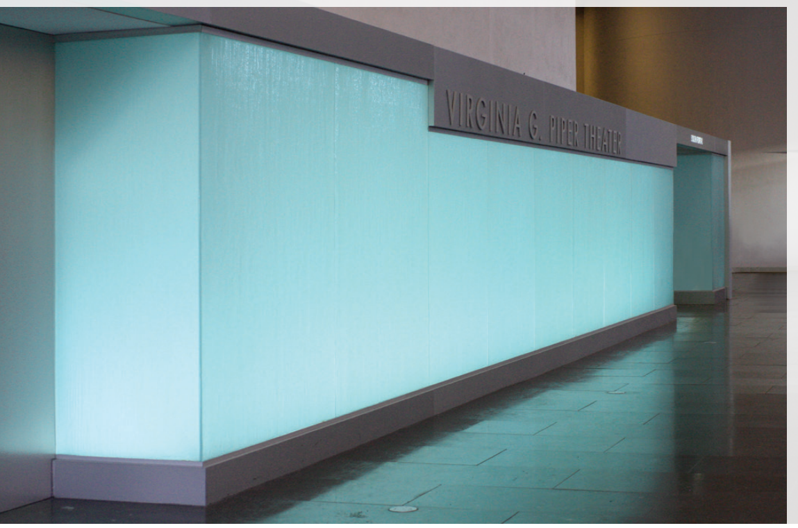
SCOTTSDALE PERFORMING ARTS- SCOTTSDALE, AZ - Kiln-Fired Tempered Glass for Feature Wall - Shown in MD213 Rigo in 1/2" Starphire - Frosted on the Smooth Side