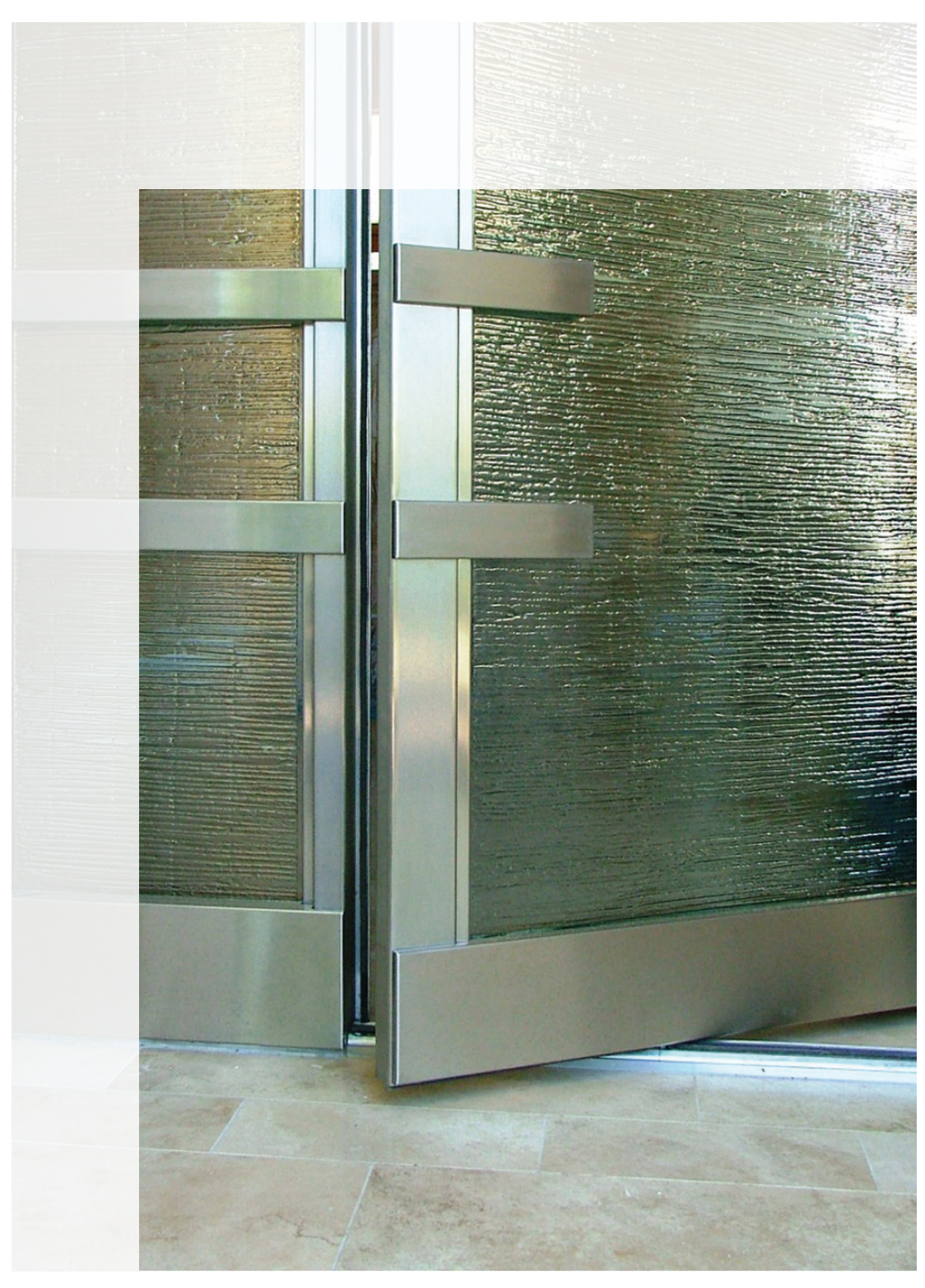
PRIVATE RESIDENCE- PARADISE VALLEY, CA - Kiln-Fired Tempered Glass for Entry Door - Shown in MD213 Rigo 1/2" Clear

Kiln-Fired Glass for Art & Architecture www.meltdownglass.com 800-845-6221