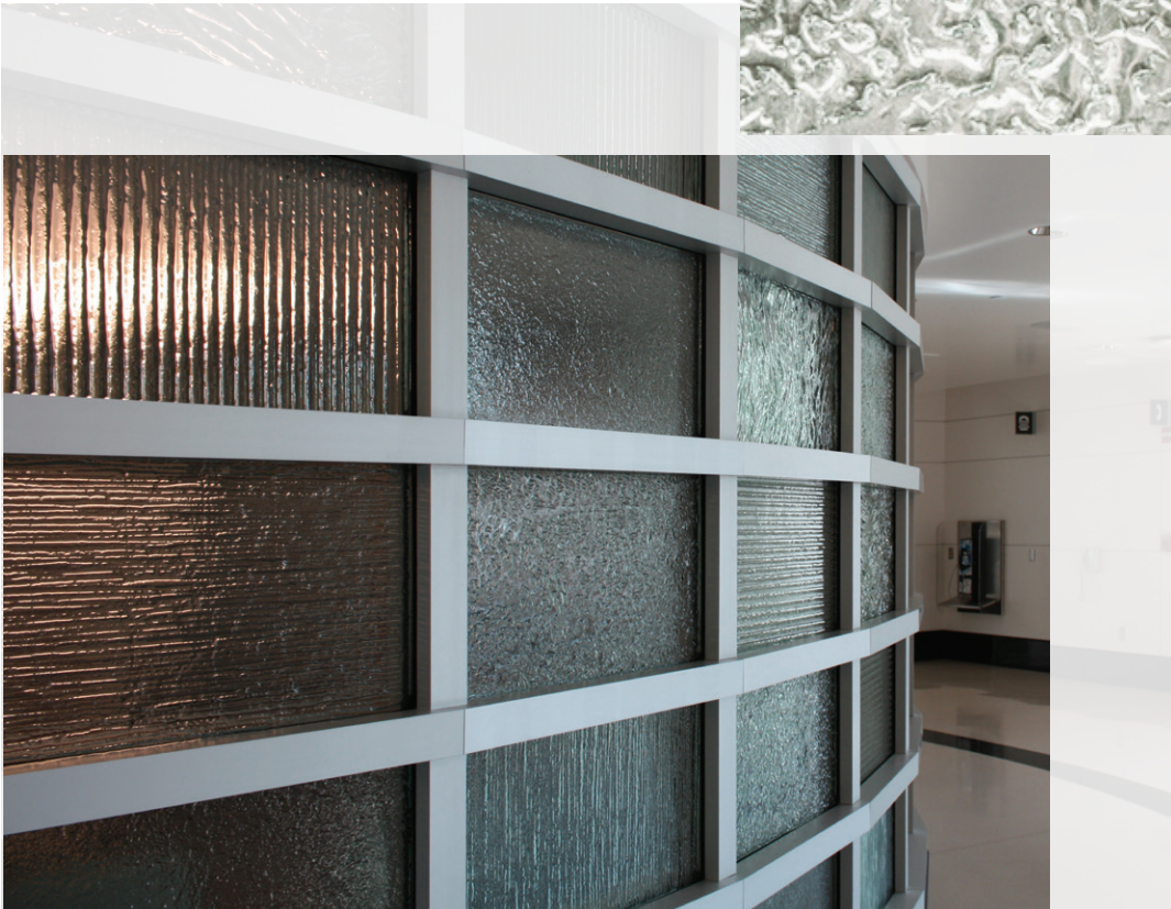
UC DAVIS MEDICAL CENTER- SACRAMENTO, CA - 1" Kiln-Fired Tempered Glass for Interior Feature Wall - Shown in MD205 Crackle / MD202 Flow / MD213 Rigo / Custom Linea Fire Rated for 60 Minutes